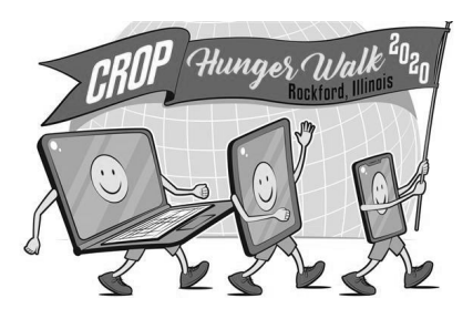
CROP WALK GOES VIRTUAL

This year the Rockford Area CROP Hunger Walk will be a virtual one. In past years many who were unable to attend the event walked in spirit. This year everyone will be a spirit walker in our virtual CROP Hunger Walk.