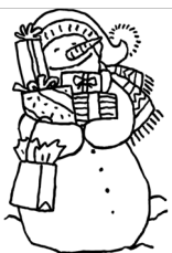
Gifts for the Staff

We have begun using a few songs from the hymnal " All Creation Sings " at both of our worship services. We have some copies available in memorial Lounge for your use. If you are interested in purchasing a copy, please contact the office.